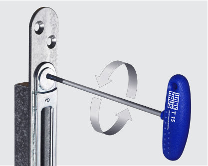
Keeps fully adjustable ±2mm utilising Torx T15 adjusting tool.

High security nickel plated steel hooks fully penetrate the keep rail and help prevent forcing apart of the sash and frame.