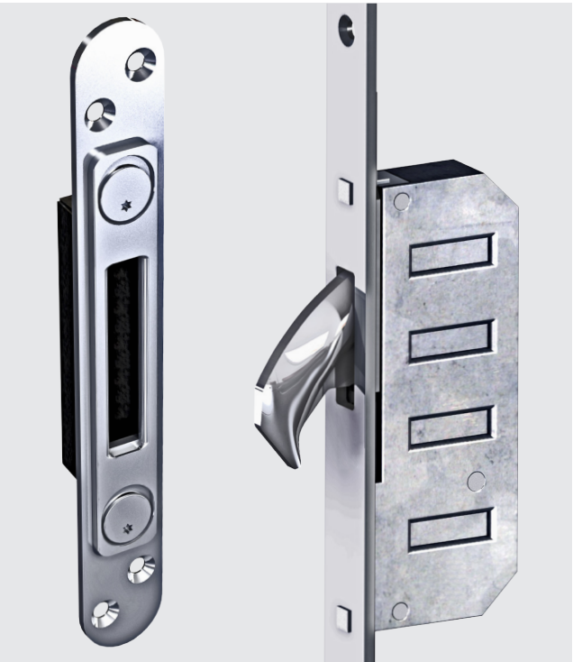
Standard 24mm wide keeps with dust boxes and off-set screw fixing for enhanced security.